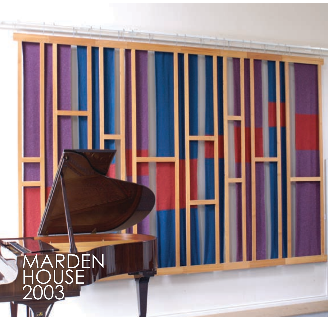
MARDEN HOUSE 2003

Marden House is a community centre located in the old wool town of Calne, North Wiltshire. Its activities include a lively arts programme, an annual music and arts festival, recitals, dance and choral singing. The 19th-century stone building was originally the canal wharf keeper's house, converted in the 1980s. The tall interior space with stone walls had an unsatisfactory acoustic and a drab appearance.