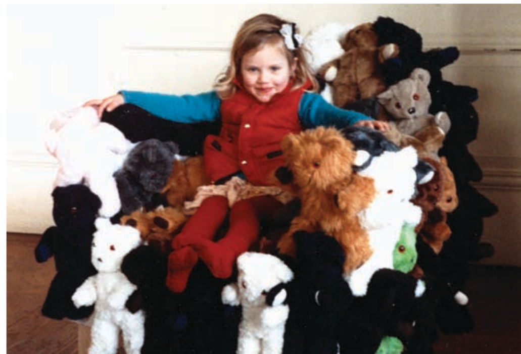
Below: Bear chair 1990

comfortably on Edra’s stand at the Milan Furniture Fair. Most interesting of all to the casual observer is the Bear chair (1990) that employed cuddly toys to upholster a seat. Over a decade later the Campana Brothers would take the same idea and use it to financial and critical acclaim.