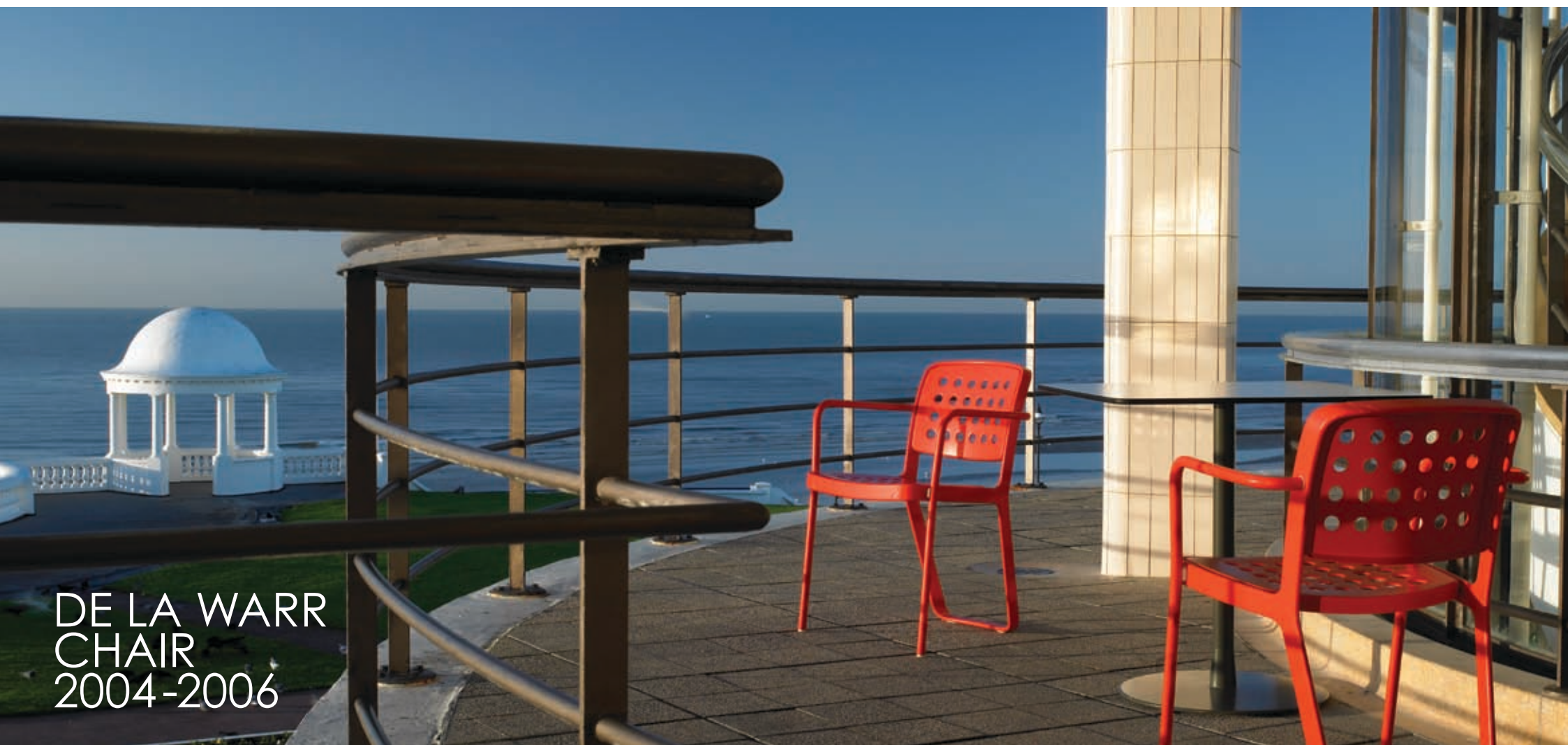
DE LA WARR CHAIR 2004-2006