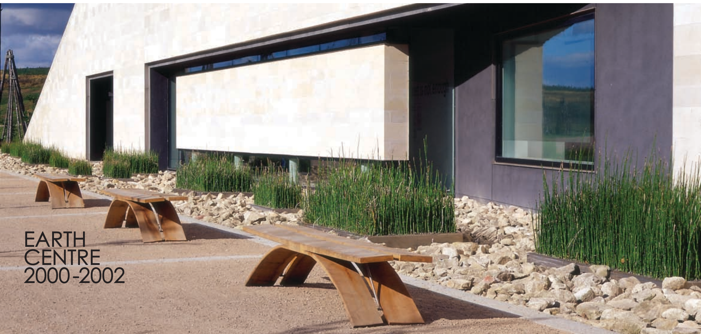
EARTH CENTRE 2000-2002