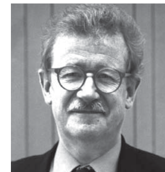
Professor Sir Christopher Frayling Rector, Royal College of Art